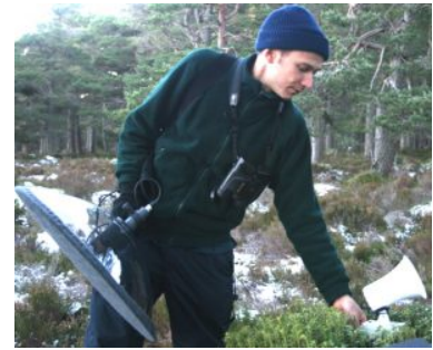
A call station to lure Scottish crossbills ( Loxia scotica ).

The Scottish crossbill ( Loxia scotica ) is Britain's only endemic bird species. A point transect study was conducted to obtain the number of birds within each point after responding to an audible lure. The probability of responding to the lure was estimated by recording the response of previously detected birds to the lure at different distances Summers and Buckland (2010) .